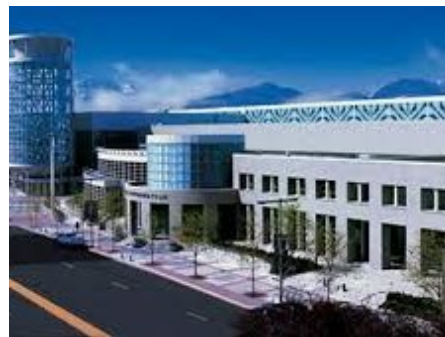
Salt Palace Convention Center