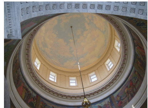
City Hall Rotunda